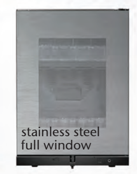
Customized silkscreening available including logo's