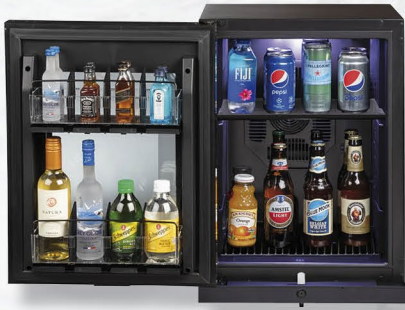
Classic LP40T glass door

SmartCube Classic minibars have been quality engineered with generous internal space, simple and stylish design, low energy consumption and silent thermoelectric cooling technology. It's a great value for your hotel.