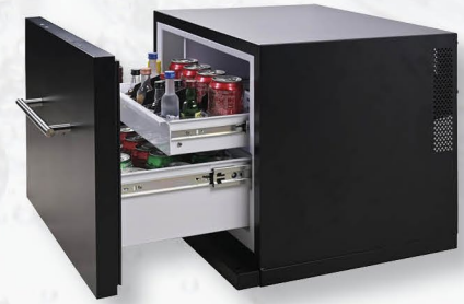
Classic DC40T Drawer minibar