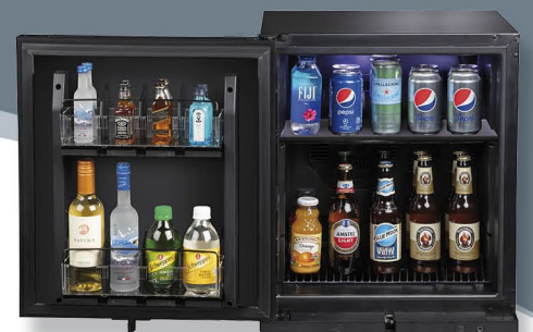
Classic LP60T solid foam glass door

MINIBAR SYSTEMS smart bars • smart people • smart solutions