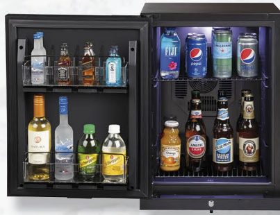
Classic LP40T solid door